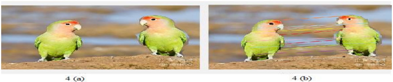
Fig.5. 4(a) forged image with reflection 4(b) forgery detection using MIFT