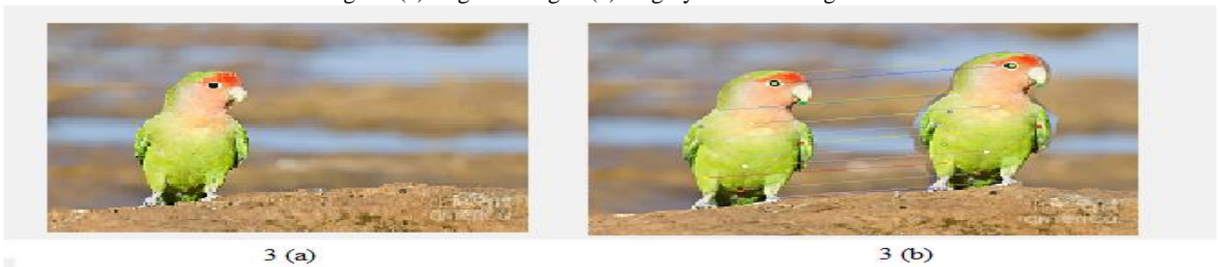
Fig.4. 3(a) forged image without reflection 3(b) forgery detection using SIFT