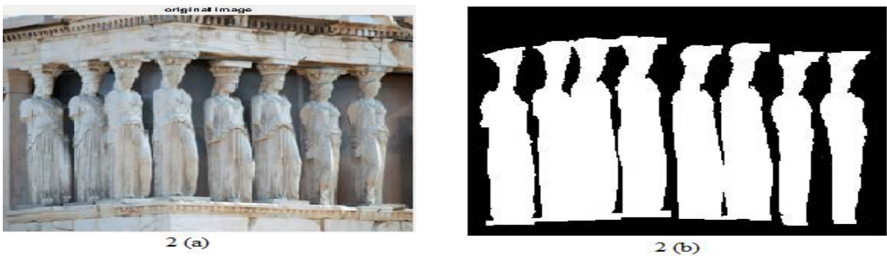
Fig.3. 2(a) original image 2(b) forgery detected image